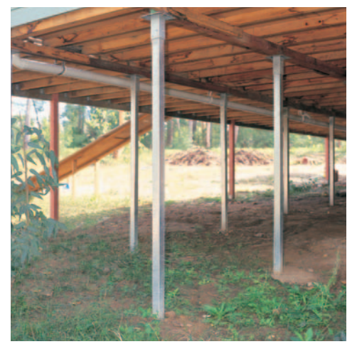
The versatility of Uni-Piers allows a floor system to be easily erected and adjusted to within millimetres on even the most difficult of building sites