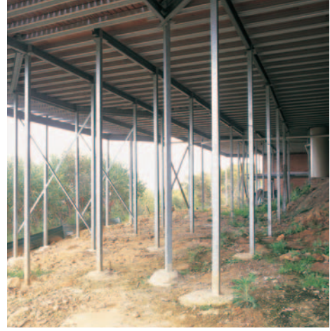
Heavy Grade Uni-Piers allow support up to 5000mm in height. Both grades of Uni-Piers can be used in load bearing and non load bearing applications.